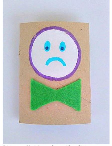
Picture 6b, The other side of the paper tube (back side) - UNLUCKY LEO