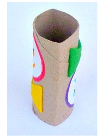
Picture 7, Magical Mr. Tumblebuddy Flipet Craft for Kids (a profile of the craft project)

IMPORTANT: Unlucky Leo's face could either be glued on the lower part of the back side of the toilet paper tube (which means the face on the back side would be upside down in relation to the face on the front side) or exactly behind the face glued on the front side (in the same direction). It depends on whether you intend to tumble and flip Mr. Tumblebuddy Flipet or only flip him. Personally, I always prefer to tumble and flip him (that's his name, after all), instead of just flipping him from front to back. Kids love that too I it reminds them of Head Over Heals gym exercises they all do to show off their tumbling skills.