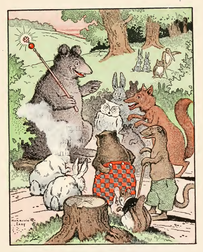
"As they were all very hungry, they would like to know when the feast would be ready." Page 38.