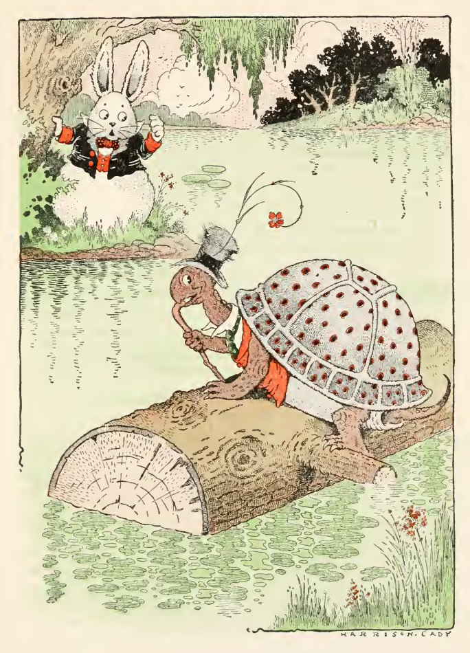
" Hi, Spotty!" he shouted. "Where do you live?" Page 204.